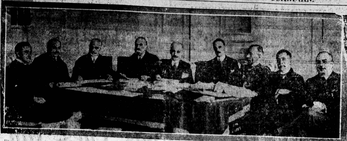
COUNCIL AT FIRST MEETING OF LEAGUE OF NATIONS ASSEMBLY

This photograph, just received from Switzerland, shows members of the League of Nations Council at the first meeting of the Assembly