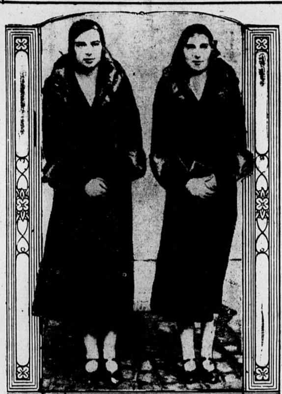
Infantas Beatrice (LEFT) and Christina, daughters of King Alfonso XIII, and Queen Victoria Eugenie of Spain, whose throne is said to be tottering in face of general strikes and rioting throughout country. The two royal princesses have four brothers, the eldest of whom, Prince Alfonso, aged 23, is heir to throne.