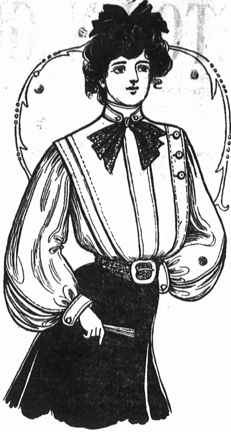
Shown here is a neat shirt waist of white linen. The throat scarf and wrinkled skirt are of Persian silk.