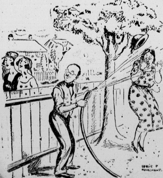
WHEN THE WORM TURNED! From London Opinion.

Also Makers of High-Grade Hosiery and Sweater Coats