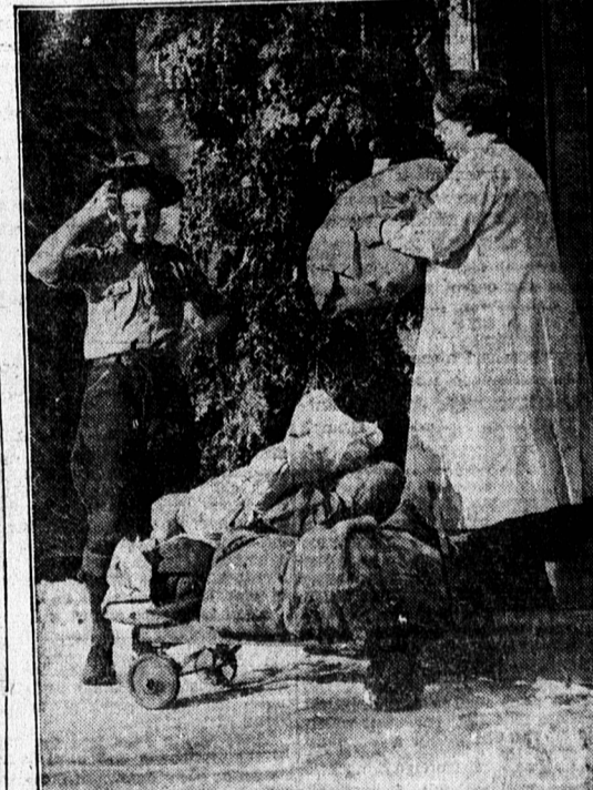
Spring Cleaning and Rummage Clearing go hand-in-hand. Here is a Boy Scout collecting Rummage from appreciative householders. The Kirk Boy Scouts' Rummage Sale is booked for Saturday evening at 6.30, when goods from some of the best homes will be on sale at giving-away prices.

export of apples, the Committee recommends for the consideration of the Advisory Board that, commencing with 1936, apples be exported only from certified orchards; or from orchards where applications for certification have been approved by the necessary authorities. The Committee further requests that the Advisory Board notify all commercial growers of