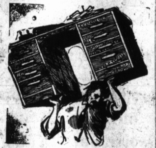
CAN'T THROW OFF HIS CARES.

The cause of this tense condition is in your stomach. Your food does not digest properly. Nine-tenths of all dyspepsia and indigestion is of the nervous type and the only certain cure is to right the cause. Tonics, brain foods, biters, etc., are mere temporary stimulants. Your stomach and small intestines have become deranged by improper selection of foods; imperfect mastication and irregularity both as to time and amount of eating.