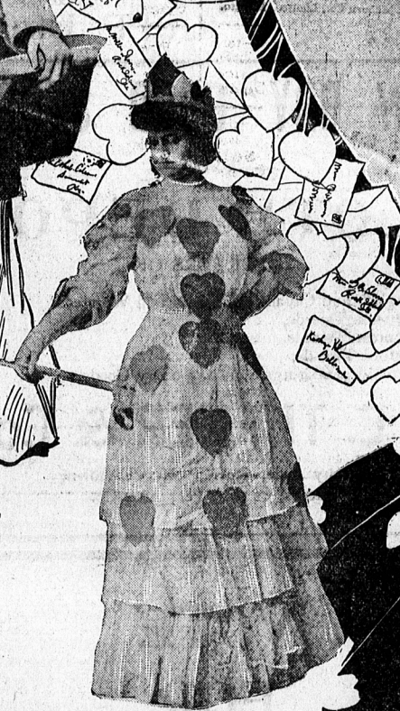
The Queen of Hearts