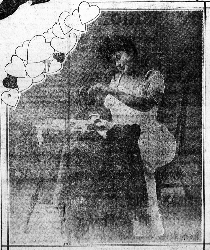
A Valentine Hostess

The person in charge of this Valentine archery has couplets for each color, which are read on each trial of skill, the couplet to be read being determined, of course, by the color of the section of the target to which an arrow has sped.