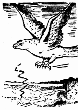
A thread of smoke was rising from the leaves on one side of the Crooked Little Path.

For days that had run into weeks there had been no rain. Night after night there had been no dew. All the trees of the Green Forest were thirsty. Those outside the Green Forest were even more thirsty. Their leaves were drying up and turning brown and dropping. The Green Meadows were no longer green, but were brown, for the grass was so dry that it was crisp. Plants of all kinds were withering and dying. Laughing Brook no longer laughed, for there was not water enough in it to more than gurgle faintly. The Smiling Pond had grown smaller until it was, as Grandfather Frog said disgustedly, little more than a puddle. The cattails and rushes around it were suffering from dry feet. Even the Big River had lost much of its bigness. So the dry weather brought thirst and discomfort and uneasiness to all who live in the Green Forest and on the Green Meadows. Dread took possession of many of them. What they dreaded they didn't know. It was just a feeling that had something to do with the dry weather. But King Eagle knew. Yes, sir, King Eagle knew. He has lived for many years, and watching so many seasons come and go, he has learned much. He knows what is likely to happen in great storms with high winds. He knows that floods follow too much rain. And he learned to associate the coming of the Red Terror which we call fire, with very dry weather.