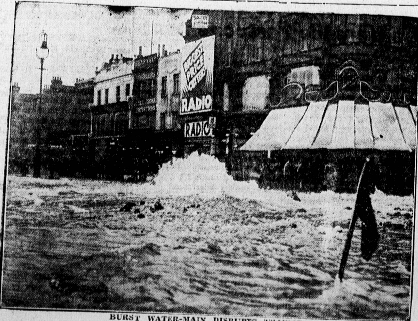
BURST WATER-MAIN DISRUPTS TRAFFIC This may look like a broken dam or tidal wave, or something, but, in reality, it's the result of a burst water-main at Nag's Head Junction, Holloway, North London, England. Needless to say, it diverted all traffic for some time.