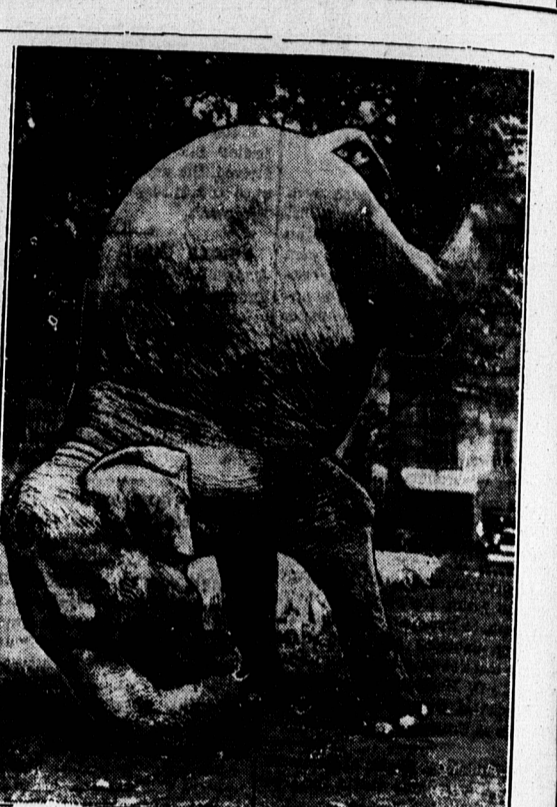
JUMBO IN A PLAYFUL MOOD "Jumbo" is here caught in a playful mood in London, Eng., Zoo, rejoicing that he has escaped from jungle to civilization, where he is assured three square meals a day and a bath thrown in for good measure.—Underwood.