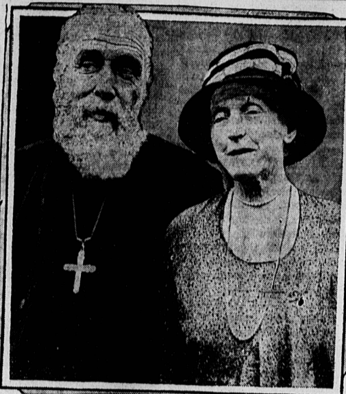
ARRIVES FOR SPEAKING TOUR