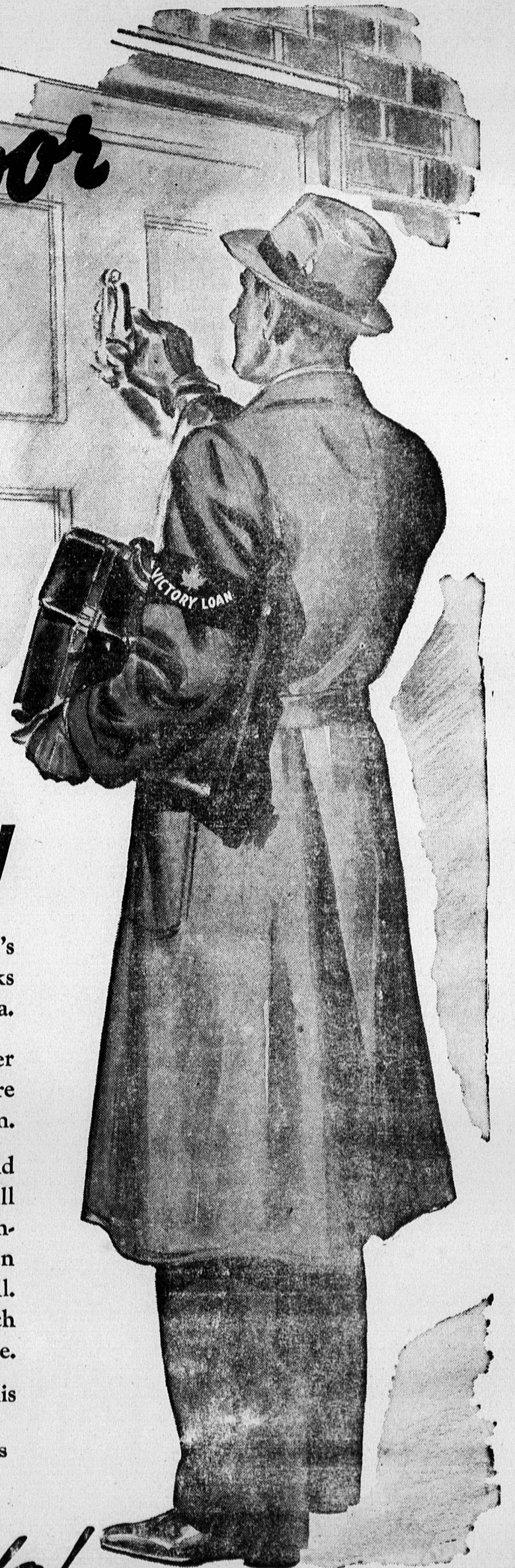
National War Finance Committee, Ottawa, Canada