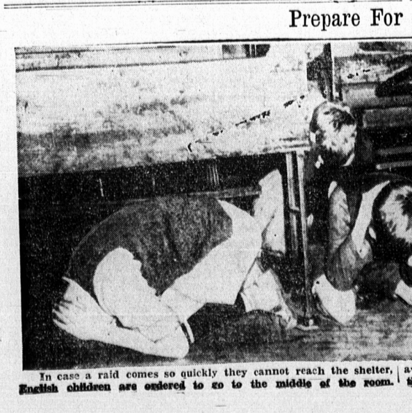
In case a raid comes so quickly they cannot reach the shelter, English children are ordered to go to the middle of the room, away from windows, and hold their hands over the backs of their necks.