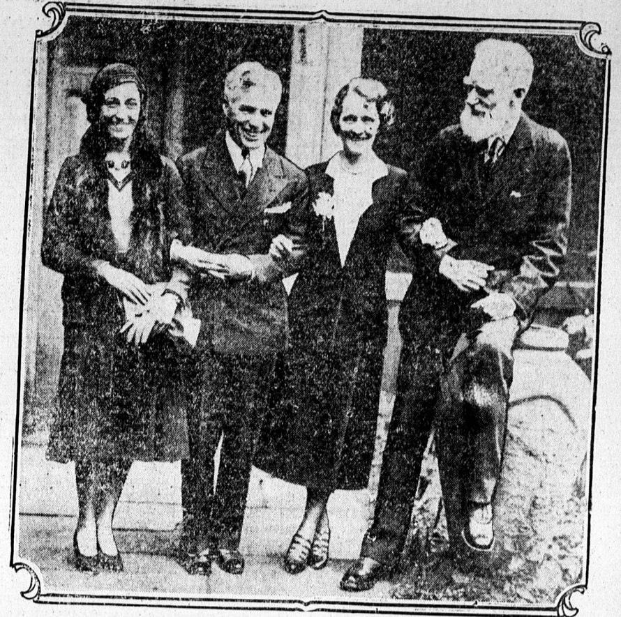
This interesting photograph shows their London residence. There the film actor met George Bernard Shaw and Amy Johnson of lone Australian flight fame. Left to right shows: Miss Johnson, Chaplin, Lady Astor and George Bernard Shaw.