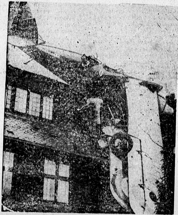
A miraculous escape from death or injury was experienced by Flight Lieutenant Fogarty, when his plane, a Royal Air Force ship, crashed into the roof of a house in an English town. The pilot crawled from the wreckage unhurt and made his way to the ground.