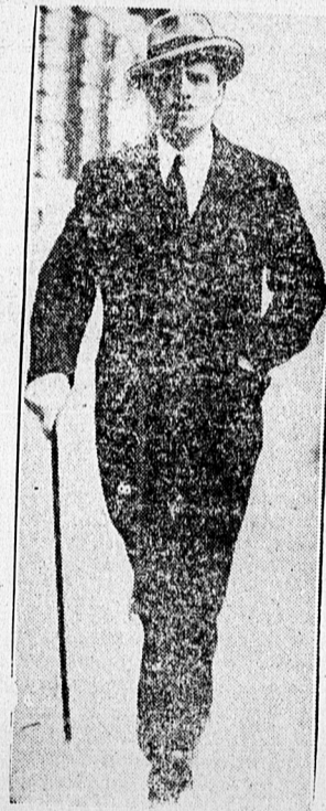
Sir Oswald Mosley, millionaire son-in-law of late Lord Curzon, may head new political party soon. He advocated establishment of five-man dictatorship in England.