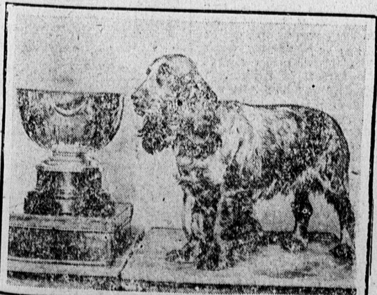
Here is H. G. May's cocker spaniel, champion of the recent Crufts dog show at London, England, with the cup he won as champion of