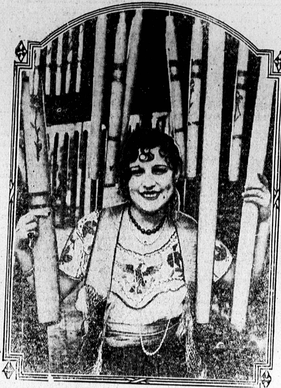
This charming Castilian-Californian is seen in an ancient candle-factory along the route of the 18-mile horse and-buggy highway which is to be reopened at Los Angeles in connection with the expected visit in September of King Alfonso of Spain to take part in the city's 150th birthday celebration. The costumes and costumes of Spain and Old Mexico will be prominent at the celebrations.