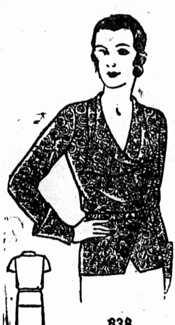
838 SNAPPY BLOUSE WITH SLIMMING DIAGONAL CLOSING

And it's a model that can be carried out in a great many different materials.