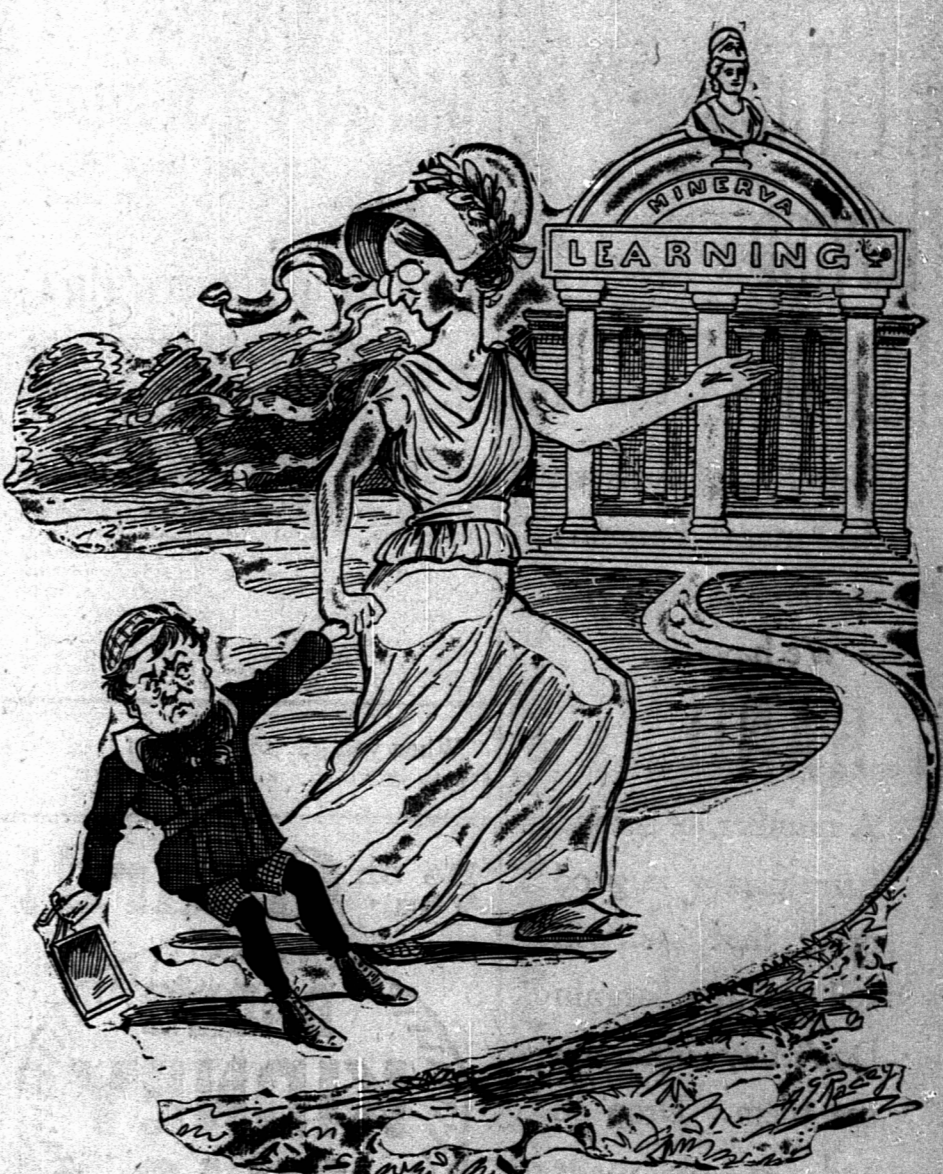
With shining morning faces creeping like snail unwillingly to school.—The School Boy—Shakespeare.

SCHOOL BOOKS, Exercise Books, Scribblers, Slates, Pencils, Inks, and all SCHOOL REQUISITES at