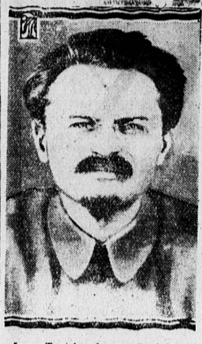
Leon Trotsky, former Soviet commissar for war, who, according to unconfirmed reports reaching Paris, was shot in the back a few days ago at his place of exile in Turkestan by an Armenian and lies in a critical condition.