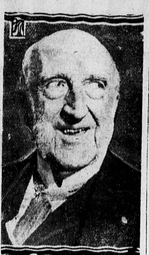
Chauncey Depew, famous American after-dinner speaker, humorist, politician, railroad magnate, who died in New York in his 94th year, after a brief attack of pneumonia.