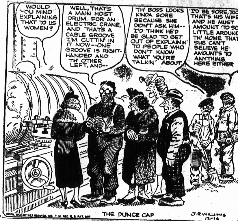
THE DUNCE CAP