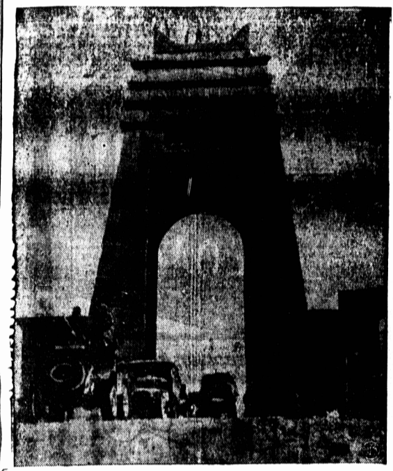
Through the Marble Arch—giant desert monument on the road to Tripoli—roll some of the British motor units that pursued German forces across Libya. The Arch is near El Aghella, Libya, and is the site of an advance RAF airfield.