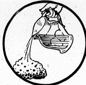
4 Acoustic Absorption

When tuning or logging short-wave stations, a movement of the tuning indicator so slight as to be invisible to the naked eye would completely de-tune or lose a program. Of the various "Band-spreading" devices created to correct this, the Rogers "8-to-1" band-spreader dial affords greatest ease and certainty for tuning and then correctly logs short-wave stations so they can be picked up again with absolute precision.