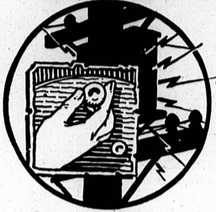
2 Locality Interference Adjuster

For the first time—real noise and interference control and suppression. Not a compromise, not a tone control that cuts the quality of music in proportion to the noise, but straight noise suppression that affords practically silent tuning between stations. Move from one station program to another as smooth as velvet.