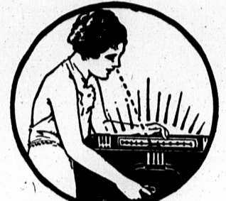
6 "Target-Tuning" Dial with Simplified Tuning Control

Rogers new-type metal spray dual-purpose tubes combine the advantages and proven performance of the glass tube, with the improved shielding capacity of the metal tube, but whereas most metal tubes of to-day can perform only one function, Rogers dual-purpose metal spray tubes function as two tubes, thereby affording vastly increased performance, tube for tube, over single-purpose tubes, and are the only metal type of tube with many years record of proven quality.