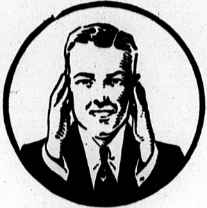
1 Noise Suppression

For the first time—real noise and interference control and suppression. Not a compromise, not a tone control that cuts the quality of music in proportion to the noise, but straight noise suppression that affords practically silent tuning between stations. Move from one station program to another as smooth as velvet.