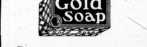
Figure out your weekly soap cost and then compare it with what your cost would be if you were using Gold Soap. Although it costs no more than ordinary soap, Gold Soap comes in much bigger cakes. It is so much better that each ounce does more work and lasts longer. A week's trial and a comparison of costs will make you a continuous user of Gold Soap.