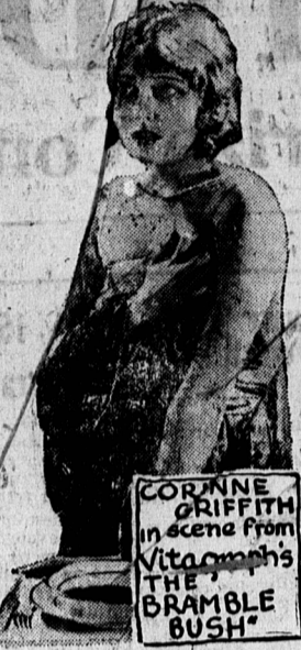
CORRINE GRIFFITH in scene from "THE BRAMBLE BUSH"

PEARL IN "The Death Studio" WHITE 10th STARTLING CHAPTER "THE BLACK SECRET"