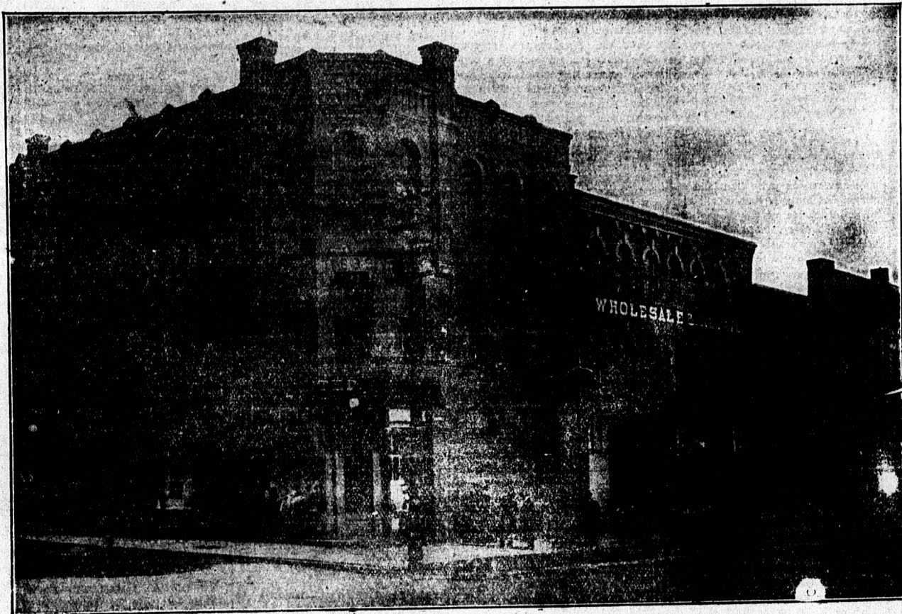
1881 PROWSE BROS., LTD., 1930 TODAY

Remember the Days Thursday and Friday May 1st and May 2nd