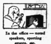
In the office—no need speakers, operating events, etc.

By actual tests this radio in East and West has pulled in distant stations with a clarity and volume equal to much more expensive sets.