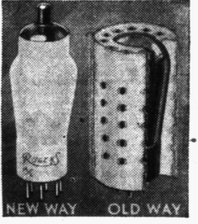
The above illustration depicts the difference between the old-fashioned type can shield with its disturbing vibration as compared with the new Rogers Seal-Shielding.

See the greatest radio value of the year. Imagine Rogers-Majestic standard of radio performance for as low as $32.50. Here is a radio for every home—regardless of size of income—for the living room or as an extra set for bedroom, den or kitchen—a small but mighty superheterodyne radio with many of the characteristics of the standard consoles.