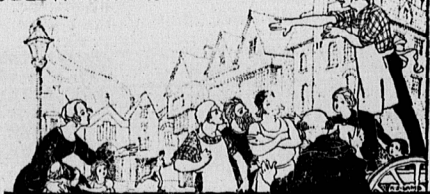
BREAD is your best food - Eat more of it -