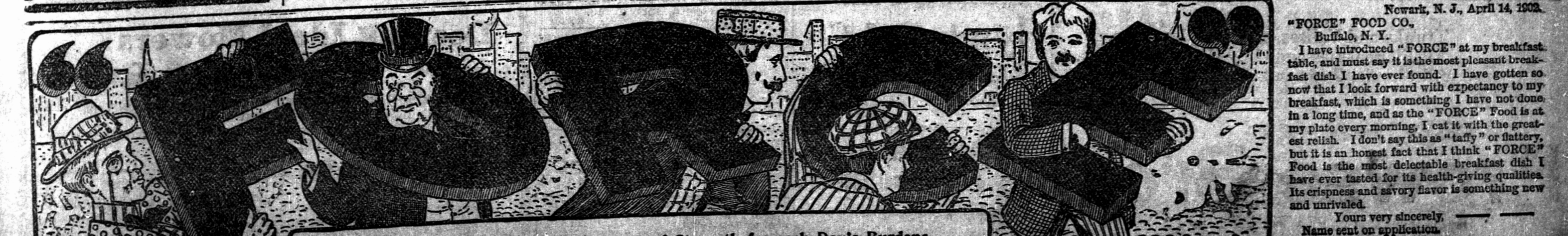
A Wheat-Malt Cereal giving an Excess of Strength for each Day's Burdens.