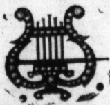
Fine 14k pearl brooch $15.50