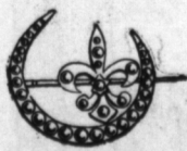
Fine 14k pearl brooch $9.50