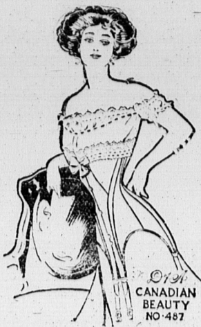
1910 CANADIAN BEAUTY NO. 487

They mold the figure to a graceful poise that shows character and distinct individuality. They will make any dress look good and a good one better. $1.00 to 3.45.