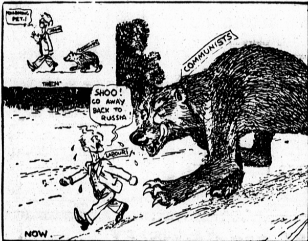
ISN'T IT A PITY PETS GROW UP! From the Western Mail, Cardiff.

ROGERS HARDWARE CO., LTD. Charlottetown Agents for McClary's Stoves and Ranges.