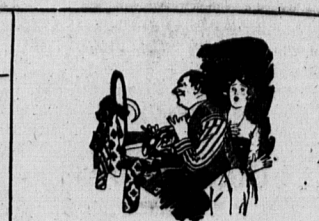
A BLOW TO LITERATURE

—U.S. Senate Again Tackles the Treaty WASHINGTON, Feb. 9.—The treaty of Versailles, which has lain in a congressional pigeon hole since November 19, while a basis for its ratification was unsuccessful.