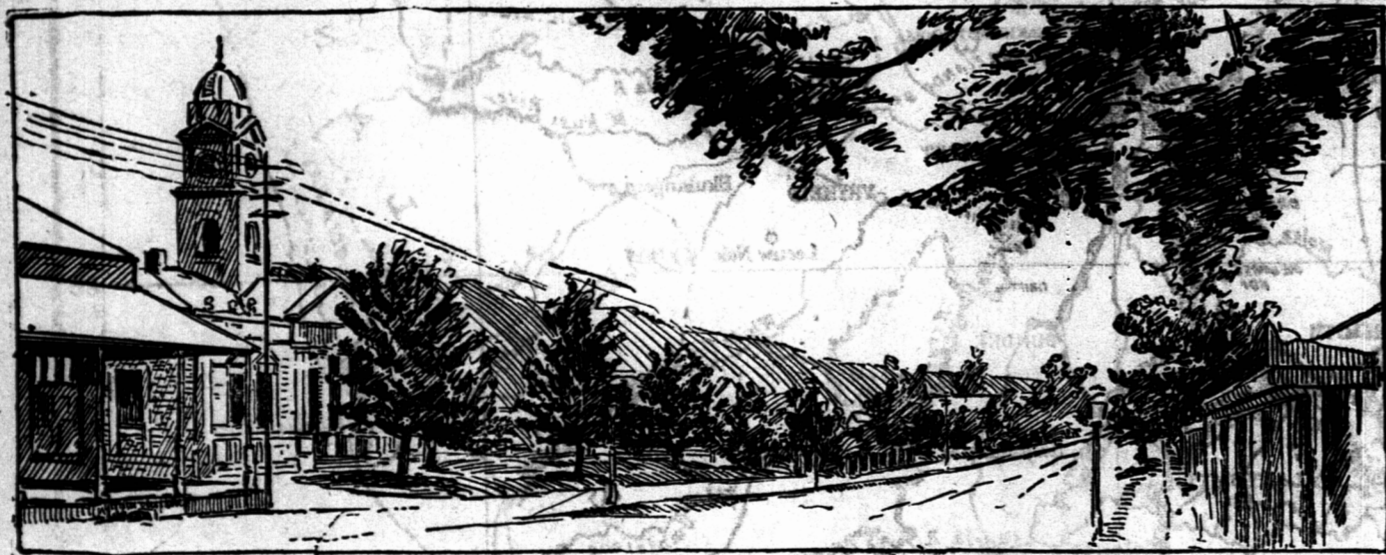
THE WAR IN THE TRANSVAAL

Ladysmith, Natal (population 2,669), the chief military station, 180 miles from Durban, 37 miles from the Orange Free State frontier at Von Reenan's Pass. There are four thousand infantry, and seven batteries, with 32 guns at Ladysmith.