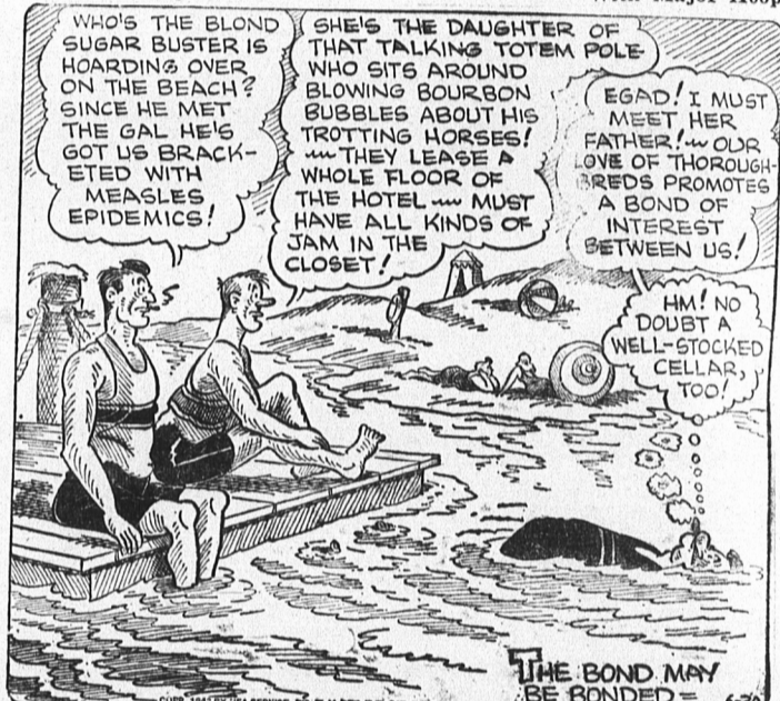
THE BOND MAY BE BONDED = 6-30