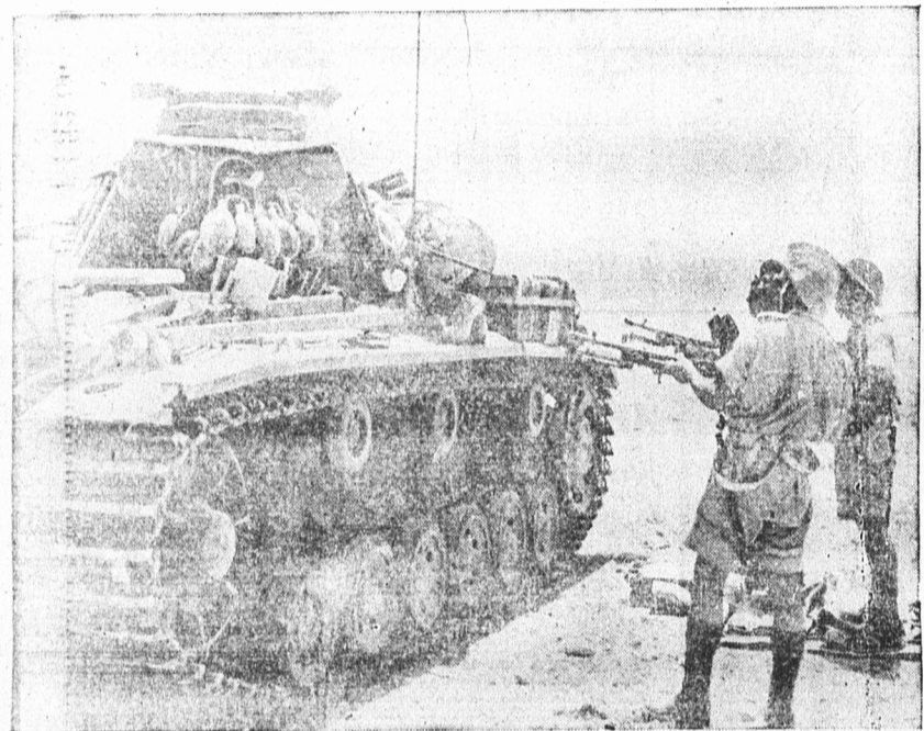
When these pictures were made in Libya a few weeks ago things going well for the British. German tanks like the captured one above were being hoisted. German prisoners like those at left below were being taken. South African gunners like those at right below were blistering the desert with bullets. But Rommel came back with bigger, better armored tanks to take many more thousands of British prisoners, a large part of them South Africans.

Night game: 000 001 030-4 7 1 Baltimore 000 100 032-6 4 1 Page and Robinson; Center and Becker.