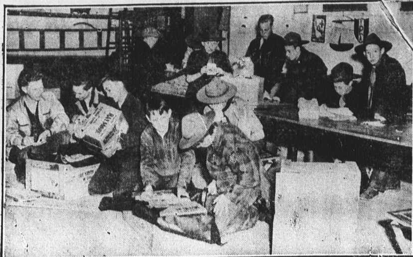
Scouts of Lethbridge, Alta., packing 400 pounds of Government approved vegetable seeds collected with the aid of the Kiwanis and Lions clubs, I.O.D.E., and the Scouts of Taber, Nobleford, Barnwell, Coaldale, Turin, Vauxhall and Picture Butte. The project was part of a Dominion wide Scout plant to provide seeds for British Scout "Dig for Victory" gardens.