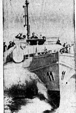
BRITAIN HAS THE ANSWER

An effective antidote to the swiftness of the Dominion government is finding difficulty in obtaining a doctor to take charge of the Pangnirtung Hospital at Cumberland Sound, Baffin Island, an official of the Mines and Resources Department said tonight. The position at Pangnirtung was a good opportunity for a young doctor every three or four years so they could be found to take the post because "all our young doctors are enlisting in the army these days."