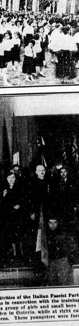
One of the principal activities of the Italian Fascist Party of Canada, now banned and its leaders interned, was in connection with the training of young children. The upper pictures show (left) a group of girls and small boys having a rest after doing physical exercises in a garden in Ontario, while at right can be seen a band formed of boys not yet in their teens. These youngsters were forced to drill regularly and wear uniforms. The lower picture shows a group of grown up members of the party standing on the platform of the organization headquarters in Montreal with a large painting of Mussolini in the background. These black-shirted men and women played a dominant part in the Fifth Column activities in this country prior to the war.