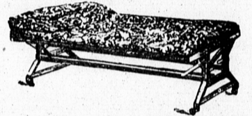
Drop side Couches $5.25

Sole Agents for "Hercules Springs" "Ostermoor Mattresses" Etc. Etc