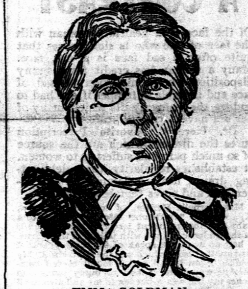
EMM GOLDMAN. Whose oratory excited Czolgosz.