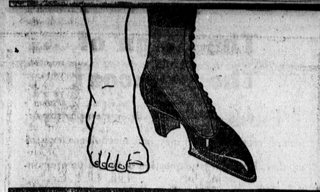
Gives Shape to the Feet