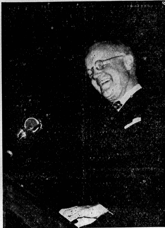
Hon. Robert J. Manion, M.C., leader of the National Government forces during his address before 15,911 Ontario citizens at Maple Leaf Gardens Monday evening, March 18th.