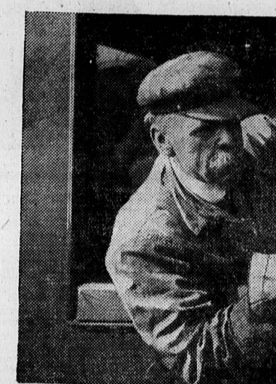
This locomotive engineer is one of 249 railroad men who told us of the protection that Sloan's gives against rheumatism, colds, muscular pain