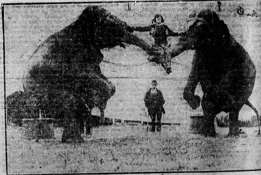
Signs of spring are here. Elephants at the winter quarters of a circus in Georgia have already begun practising new stunts and brushing up on old ones preparatory to the opening of the show season