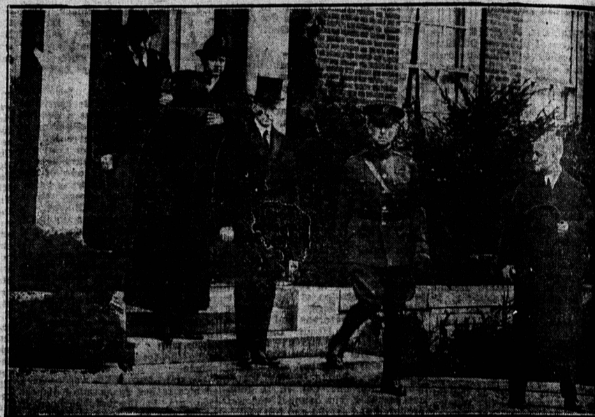
President and Mrs. Coolidge are shown standing in front of the Wilson home in Washington. The funeral procession of the late war-time president started for the national cathedral of Albany