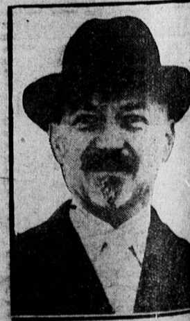
Otta Wiedfeldt, German ambassador to the United States, may be recalled by his country, due to his failure to half-mast the embassy flag in Washington in tribute to the late war president, Woodrow Wilson