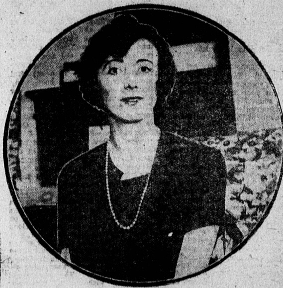
Mrs. Rosita Forbes, noted English woman explorer, has shattered many ideals concerning romantic desert Valentinos. Mrs. Forbes declares that in her travels she found Shiiks love only their camels