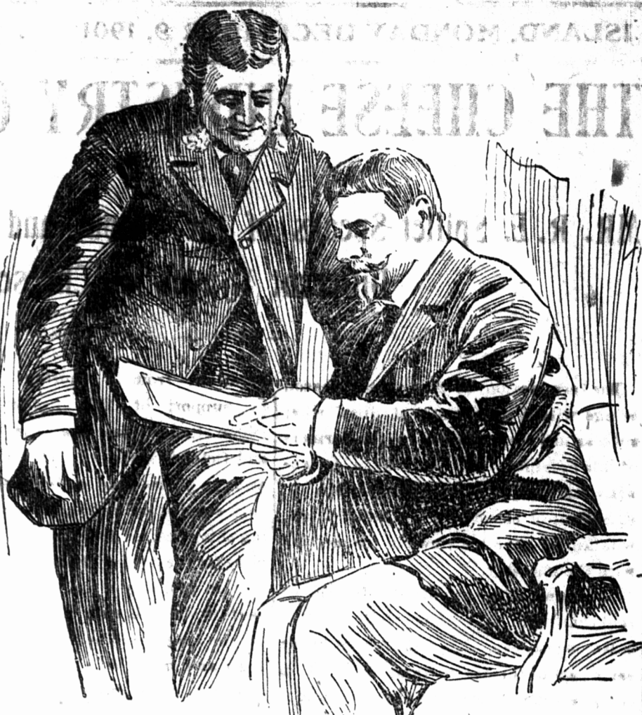
MESSRS. LABORI AND DUNAUGE, Counsel for Captain Dreyfus.—The one sitting is M. Labori.