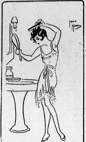
"A girl who wouldn't sacrifice her life to keep down expenses will cheerfully dye to keep up appearances."