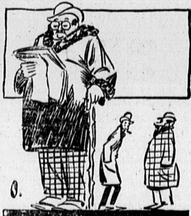
WHERE HE WAS WRONG "That man isn't anything but a bootlegger and he always tries to look like a big business man." "But, my dear fellow, he is a big business man."

Children Gladly take it for Colds Buckley's Mixture is "different". Its taste is pleasing. Its action is so quick that one dose stops a spasm of coughing—and there are 40 doses in a 15-cent bottle! Every member of the family derives benefit from "Buckley's". Have a bottle in the house at all times. Drugists everywhere sell "Buckley's" under a positive guarantee.