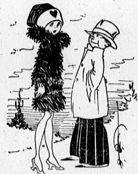
She: I can read you like a book. He: Well, you'd better skip some of the chapters.