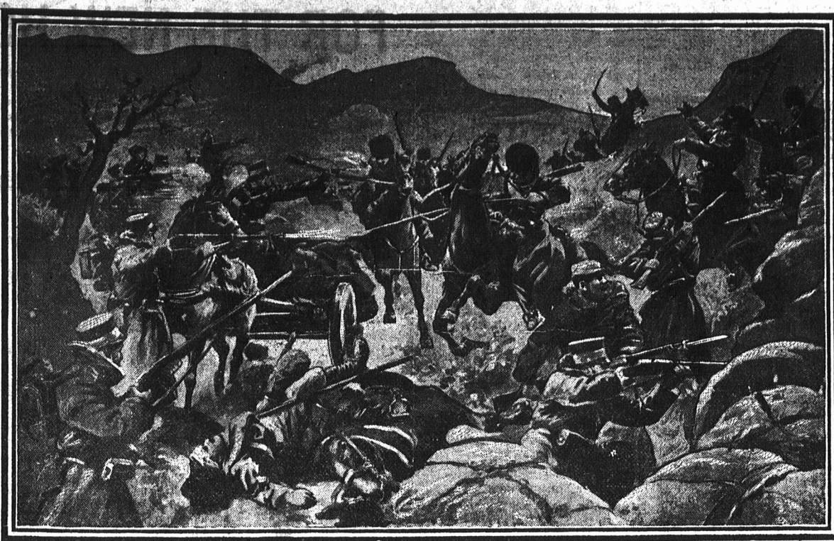
RUSSIAN RETREAT TO NEW CHWANG.

KUROKI'S GREAT VICTORY. Gen. Kuroki reports that his victory over the Russians, July 31, was the most important since the war began as the forces engaged were more numerous. There is no fresh word from the front today.