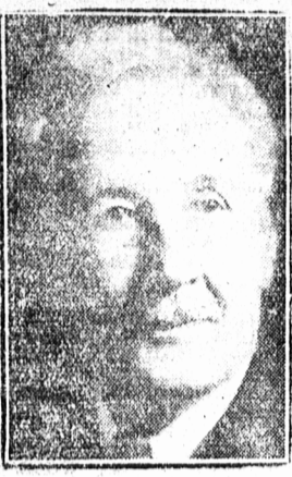
Gen. Sir William Otter, Canada's "grand old military man," who rose from private to general and who will celebrate his 83rd birthday next Friday.

(Special to The Guardian) OTTAWA, Dec. 4.—His Royal Highness Prince George—The Sailor Prince—arrived in Ottawa at six o'clock this morning to spend the weekend with His Excellency the Governor-General and Lady Willingdon.