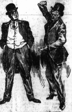
A CONVINCING ARGUMENT.

Common sense is just as necessary (even more so) in medicine as in business or the affairs of every day life.