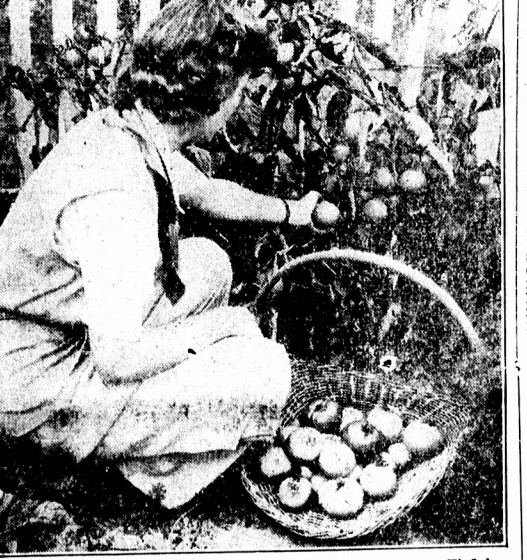
For the Room They Take, Tomatoes Grown on a Fence or Tied to Stakes Give a Heavier Yield.

In Victory gardens totaling less than 1,500 square feet in area, tomatoes should be staked, or trained to a fence. If your garden lacks a fence, stakes should be prepared with care in advance of setting the plants. Tomato stakes must be sturdy, at least 1 by 2 inch material, five or six feet long and pointed at the bottom so they can be driven a foot into the ground. Single stakes can be used, but a better way is to nail three cross to the base should be allowed to grow, and all others pinched out while they are tiny, until the plant approaches the top of the stake. Then pruning can be stopped. Tomato plants must be carefully tied to the stake, as they are not naturally climber, or heavy cord which will not cut the stem, should be used, and tied with a loose loop around the stem. While there are other methods of staking tomatoes, which do not require heavy pruning, they also take more space, and this is the chief purpose of staking plants in small gardens. A pruned plant will not produce as large a crop as one which is allowed to sprawl on the ground; but thirty-six staked and pruned plants can be grown in a 50 foot row, with other crops between the rows, and this method will produce a much greater yield for the space occupied than could be harvested from the same space growing unpruned plants. If your tomatoes are not to be pruned and staked, it will save some space to grow small-vine, or determinate varieties, which stop growing after the stems are about two feet long.