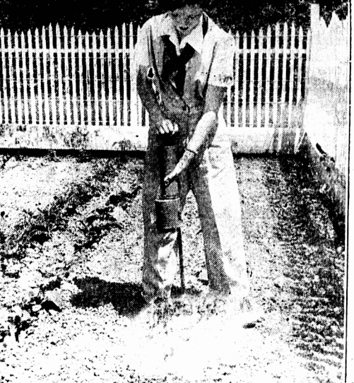
A Cupful of Dust Can Be Applied to Crops Under Attack in a Few Minutes.