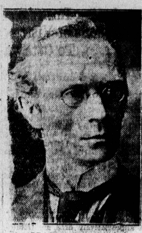
PROF. E. McNEILL Free State member of the Irish Boundary Commission who has resigned and rendered all the work of that useless.