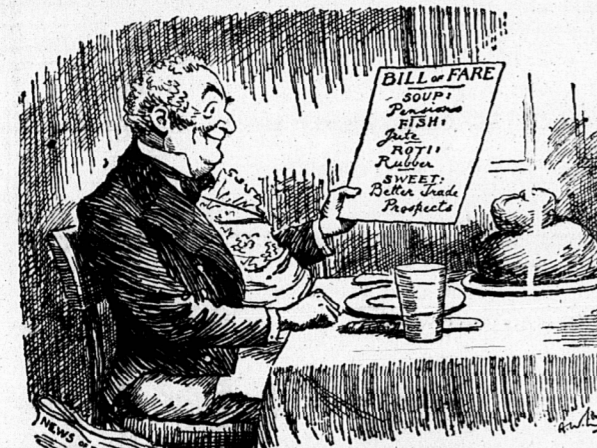
John Bull: "If I can only keep up this form 1926 will be a boom year."

THE CARLETON HOTEL HEADQUARTERS IN HALIFAX.