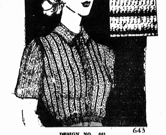
DESIGN NO. 643 CROCHETED BLOUSE

If you liked your suggestion that we give you a crocheted blouse to wear with your fall ensembles and knit suits. This one is very quickly made. Rows of pale colored single and double crochet are interspersed with rows of single crochet in a much darker thread. Buttons are used to finish the front and sleeves.