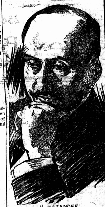
M. SAZANOFF, Russian Minister of Foreign Affairs. He made strenuous and apparently sincere efforts to prevent war in the Balkans, hurrying from one European capital to another in the interests of peace.