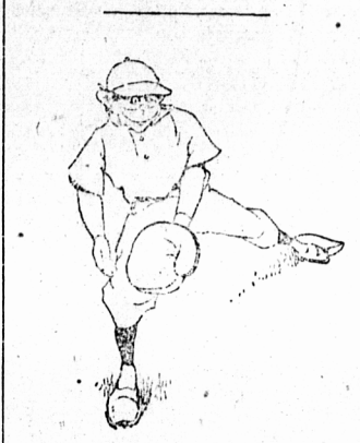
A GOOD RUN.