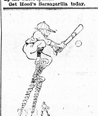
AS SEEN AT THE PARK.

It increases the red corpuscles and makes strong the white corpuscles, and thus protects and restores the health. It cures scrofula, eczema, eruptions, oostarrh, rheumatism, anemia, nervousness, that tired feeling, dyspepsia, loss of appetite, general debility and builds up the whole system. Get Hood's Sarsaparilla today.