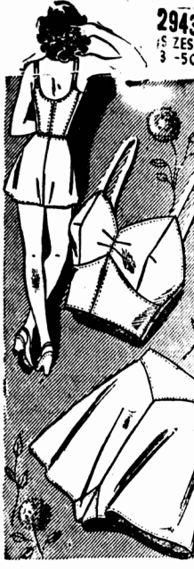
2943 25 2ES 3-50